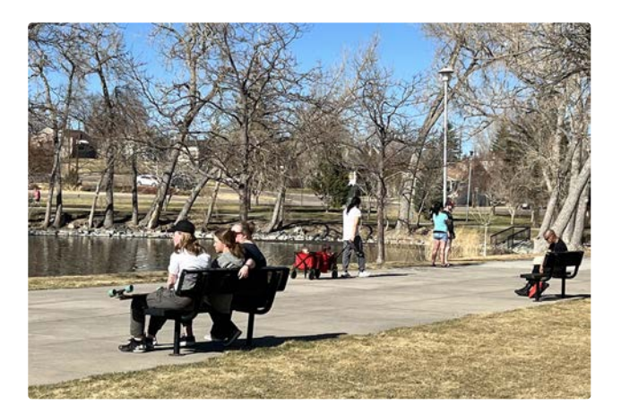
Weather Whiplash: Cheyenne Obliterates Old Record, Hits 80 Degrees on Tuesday