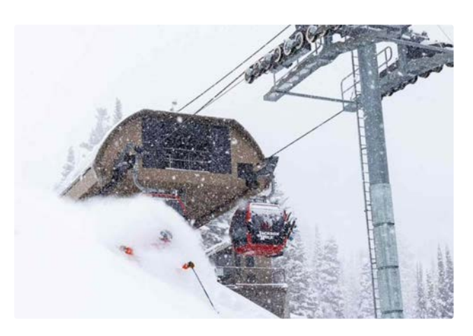
At Nearly 600 Inches, Jackson Hole Mountain Resort Sets All-Time Snow Record