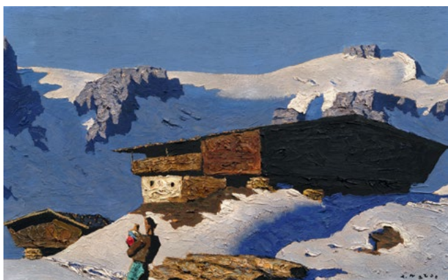
3238 ALFONS WALDE Isolated mountain farm. 1934. Oil on board. 42.4 × 67.7 cm. CHF 100 000 / 180 000