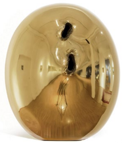
3671 LUCIO FONTANA Concetto Spaziale, Natura. 1967. Multiple. Polished bronze. 230/350. H 28 cm. CHF 35 000 / 55 000

Koller is the leading Swiss auction house, with offices in Geneva, Munich, Düsseldorf, Florence and Beijing. Each year Koller holds over 80 auctions, covering all of the major collecting categories in the fine and decorative arts, jewellery & watches, Asian art, books and wine. Koller regularly sets record prices and benefits from a large base of international bidders. With its team of highly experienced specialists, the family-owned auction house combines the distinct advantages of an internationally active auction house with Swiss reliability and efficiency.