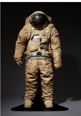
4047 ORLAN-M SPACE SUIT Manufactured by NPP Zvezda. 1990s. 170 × 80 × 60 cm. CHF 80 000 / 120 000

Over 300 lots of Jewellery will be sold on 27 November, with pieces from famous makers such as Cartier, Bulgari, Lalaounis and Gübelin . The Watches auction on 3 December will satisfy collectors with its selection of classic Patek Philippe and Rolex wristwatches. The fifth edition of Out of This World features an original Soviet space suit (lot 4047, CHF 80 000 / 120 000 ), as well as a space-flown Omega Speedmaster wristwatch (lot 4048, CHF 120 000 / 180 000 ).