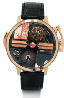
2861 JACOB & CO 'OPERA SCARFACE' 18K Rose gold. With triple-axis tourbillon and music box. Reference: OP110.40. CHF 20 000 / 40 000