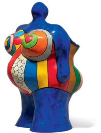
3667 NIKI DE SAINT PHALLE Nana Vase. 1984. Painted polyester. 89/150. 47 × 30 × 30 cm. CHF 15 000 / 20 000