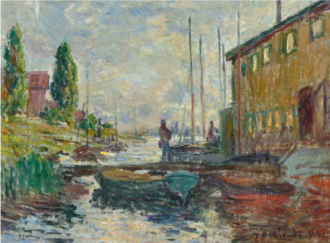
3214 CLAUDE MONET Le bassin d'Argenteuil. 1875. Oil on canvas. 54 × 74 cm. CHF 2 000 000 / 3 000 000