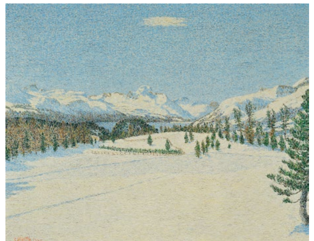
3066 GOTTARDO SEGANTINI Lake Sils with a view of Maloja. 1960. Oil on fibreboard. 64.5 × 83 cm CHF 80 000 / 120 000