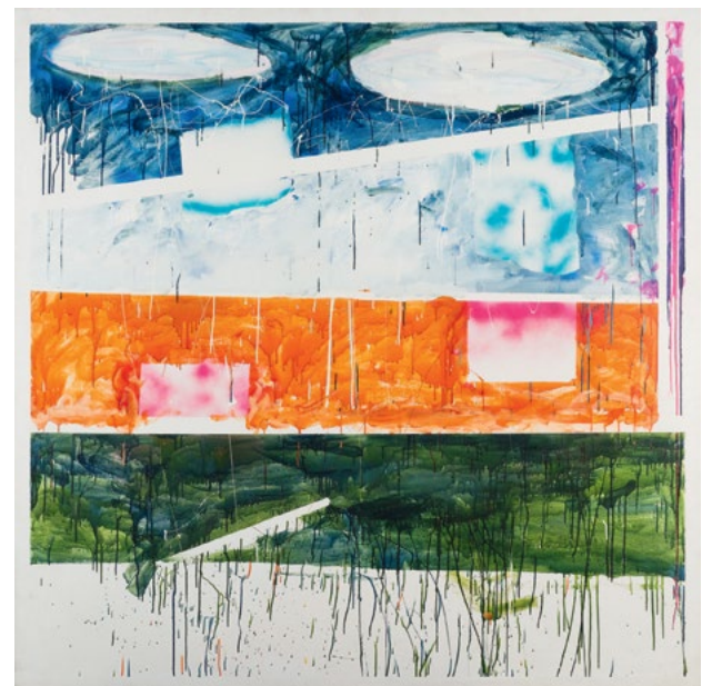
3421 ROBERT RAUSCHENBERG Jones Diner (Anagram). 1995. Vegetable dye transfer on paper. 115.8 × 76 cm. CHF 35 000 / 55 000