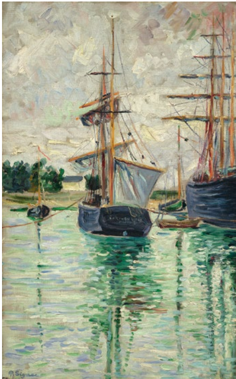
3205 PAUL SIGNAC Port-en-Bessin. Brick. 1884. Oil on canvas. 61.5 × 38 cm. CHF 80 000 / 140 000