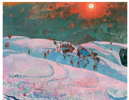
3049 CUNO AMIET Wintersonne. 1927. Oil on canvas. 79.5 × 100 cm. CHF 160 000 / 240 000