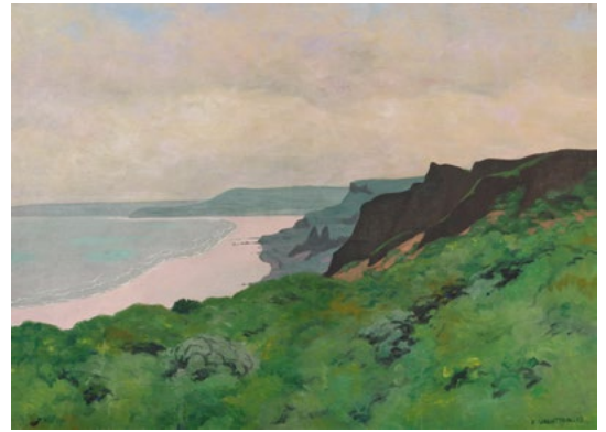
3035 FÉLIX VALLOTTON Plage au matin, Houlgate. 1913. Oil on canvas. 73 × 100 cm. CHF 300 000 / 500 000