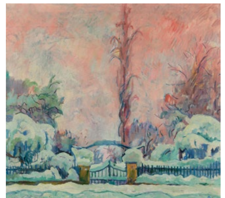
3032 GIOVANNI GIACOMETTI Nevicata, snowfall. 1919. Oil on canvas. 85 × 92.5 cm. CHF 150 000 / 250 000