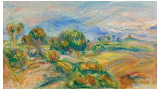
3230 PIERRE-AUGUSTE RENOIR Paysage. Circa 1910. Oil on canvas. 28 × 46.5 cm. CHF 220 000 / 320 000