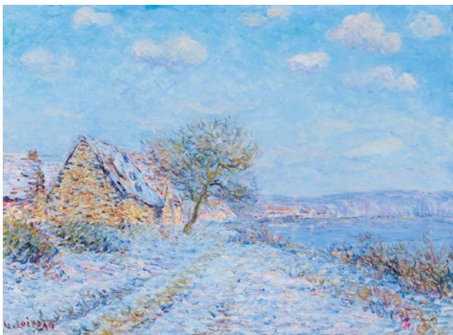
3209 GUSTAVE LOISEAU Tournedos-sur-Seine. Neige, givre, soleil. 1899/1900. Oil on canvas. 54.6 × 73 cm CHF 150 000 / 250 000