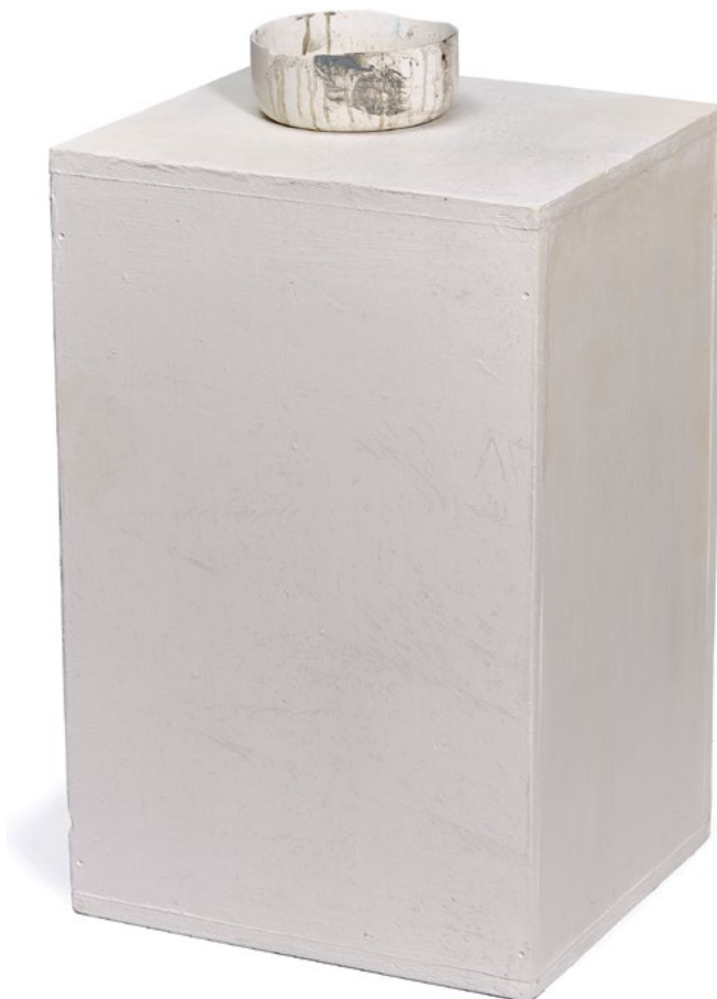
3473 PETER FISCHLI & DAVID WEISS Untitled. 2001. Painted polyurethane. Cuboid 80 × 50 × 44 cm. Bowl 8.5 × 19 × 19 cm. CHF 70 000 / 100 000

Also featured in the Swiss Art auction on 29 November are several works by Félix Vallotton , including a strikingly modern view, 'Plage au matin, Houlgate', 1913 (lot 3035, CHF 300 000 / 500 000 ). Marvelous winter landscapes by Cuno Amiet (lot 3049, CHF 160 000 / 240 000 ) and Gottardo Segantini (lot 3066, CHF 80 000 / 120 000 ) will be accompanied by a striking portrait of sculptor Helene Zelezny-Scholz by Augusto Giacometti (lot 3027, CHF 150 000 / 250 000 ).