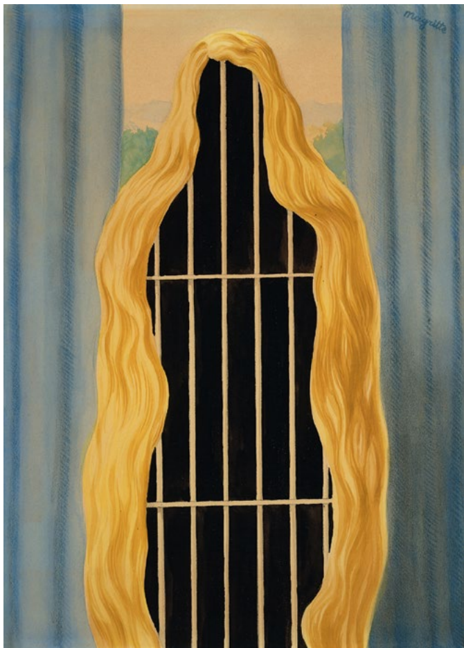
3257 RENÉ MAGRITTE Moralité du sommeil. Circa 1941. Gouache on paper. 33 × 24.1 cm. CHF 400 000 / 700 000