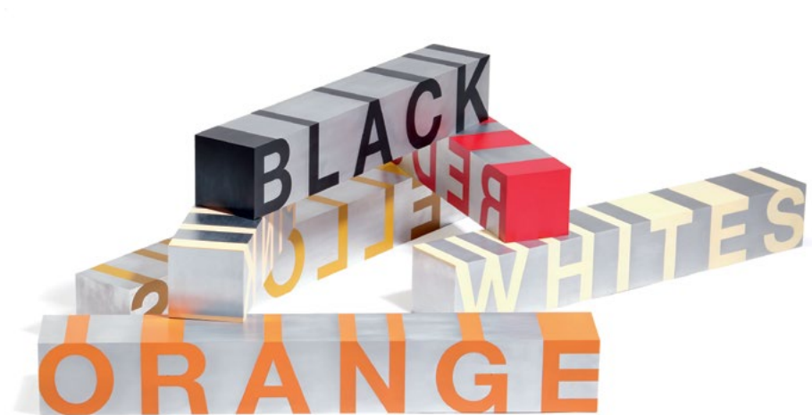
3406 RONI HORN Steven's Bouquet. 1991. Aluminium and synthetic resin, in 6 parts. 1/3. 160 × 120 × 38.5 cm (variable dimensions). CHF 120 000 / 180 000