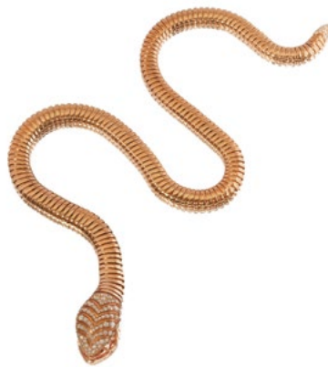
2229 A DIAMOND AND GOLD TUBOGAS NECKLACE BY BULGARI, WITH ASSOCIATED EARCLIPS 18K rose gold, 161g. Serpenti model. CHF 25 000 / 35 000