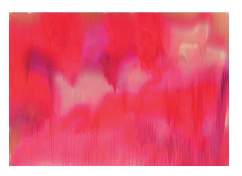
3451 KATHARINA GROSSE Untitled. 2000. Acrylic on canvas. 200 × 284 cm. CHF 180 000 / 250 000 Sold for CHF 225 000

In the Impressionist and Modern Art auction on 21 June, works by early 20th-century woman artists were in demand, such as an autumnal landscape with riders by Marianne von Werefkin that sold for a world auction record CHF 475 000 (lot 3235, estimate CHF 100 000 / 150 000), and Gabriele Münter's 'House on the lake with blue mountains' from 1933–35 that changed owners for CHF 250 000 (lot 3247, estimate CHF 120 000 / 200 000).