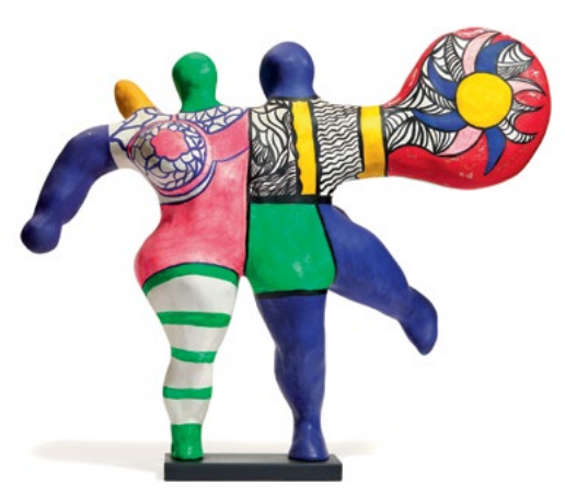
3447 NIKI DE SAINT PHALLE Les patineurs (couple ailé). Painted resin. Unique piece. 49 × 65 cm. CHF 25 000 / 35 000 Sold for CHF 107 000