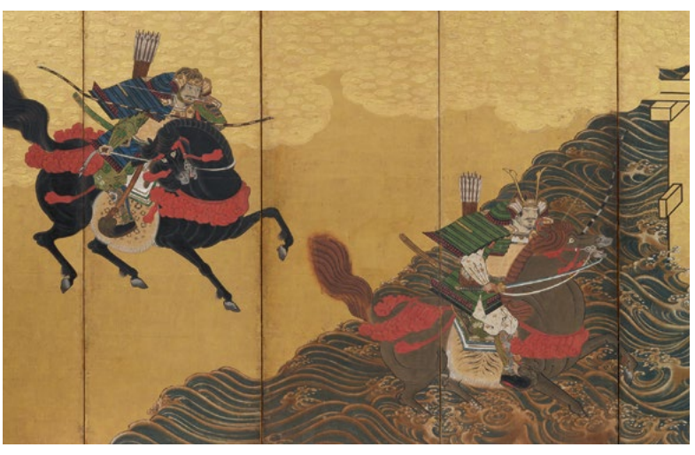
376 A MAGNIFICENT PAIR OF HASEGAWA SCHOOL STANDING SCREENS Japan, early 17th century Ink, colours and gold as well as gold leaf on paper. 169.7 × 376 cm each. CHF 80 000 / 120 000 Sold for CHF150 000