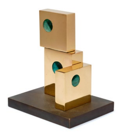
3292 BARBARA HEPWORTH Three forms (Extra eye). 1969. Polished bronze. H 20 cm. CHF 60 000 / 80 000 Sold for CHF168 000