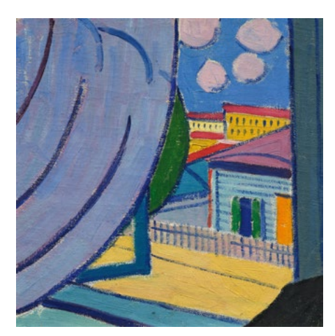
3239 ALEXANDER KONSTANTINOVICH BOGOMAZOV

View form the window. 1913. Oil on canvas. 34\times34 cm. CHF 60 000 / 90 000 Sold for CHF 143 000