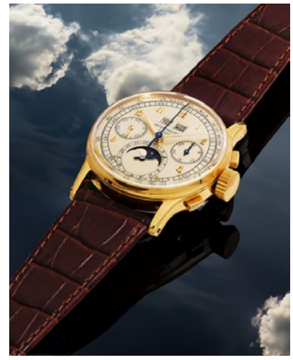
2885 PATEK PHILIPPE Perpetual calendar with chronograph Ref. 1518, 1950. 18K yellow gold. CHF 180 000 / 360 000 Sold for CHF500 000