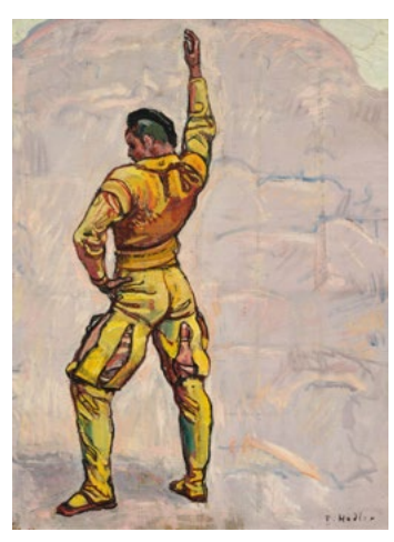
3047 FERDINAND HODLER Unanimity, Oath taker. 1913. Oil on canvas. 88 × 64.5 cm. CHF 100 000 / 150 000 Sold for CHF 237 000