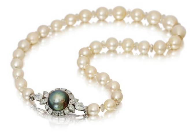
2314 NATURAL PEARL AND DIAMOND NECKLACE, PROBABLY BY CARTIER. London, circa 1920. CHF 70 000 / 100 000 Sold for CHF 400 000

The Jewellery auction on 19 June was once again very successful, with hammer prices totalling 97% of the lower estimates, including a beautiful natural pearl and diamond necklace attributed to Cartier that fetched CHF 400 000 against an estimate of CHF 70 000 / 100 000 (lot 2314). In the Watches auction on 17 June, an early Patek Philippe perpetual calendar watch changed hands for CHF 500 000 (lot 2885, CHF 180 000 / 360 000).