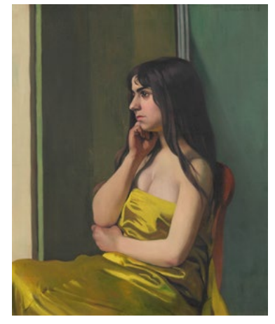
3041 FÉLIX VALLOTTON Torse à l'étoffe jaune. 1913. Oil on canvas. 81 × 65.5 cm CHF 100 000 / 150 000 Sold for CHF 225 000

View form the window. 1913. Oil on canvas. 34\times34 cm. CHF 60 000 / 90 000 Sold for CHF 143 000