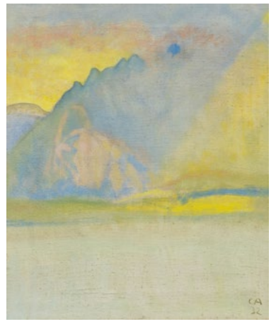
3046 CUNO AMIET View of the Stockhorn with lake Thun. 1932. Oil on canvas.46 × 37.5 cm CHF 60 000 / 80 000 Sold for CHF 168 000