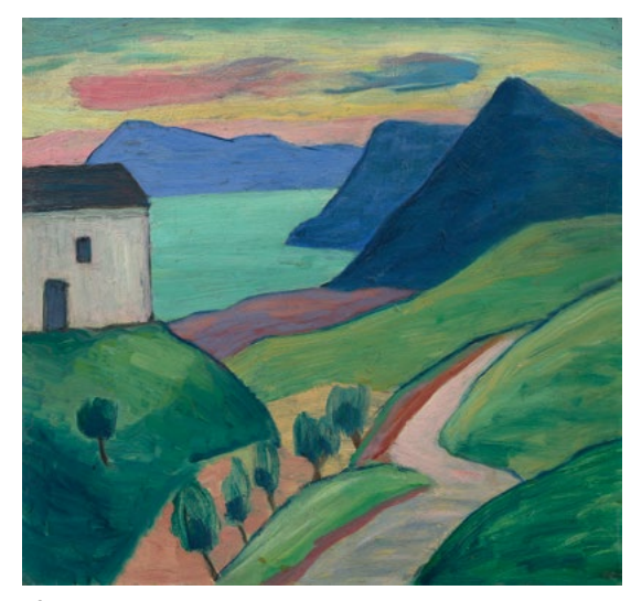
3247 GABRIELE MÜNTER Haus am See mit blauen Bergen. 1933–35. Oil on board. 38 × 40 cm. CHF 200 000 / 300 000 Sold for CHF 250 000

The top lot in the Asian Art auction on 18 June was a work by the highly sought-after Chinese artist Lin Fengmian , which sold well above its estimate at CHF 375 000 (lot 251, estimate CHF 180 000 / 250 000). Although the owner was sad to see the painting leave his collection, he can't complain about the result: he saw the work years ago at a flea market , and although he knew nothing about the artist, fell in love with it and purchased it ... for CHF 400. A pair of Hasegawa school standing screens were acquired at the auction by the prestigious Rietberg Museum in Zurich for CHF 150 000 (lot 376, estimate CHF 80 000 / 120 000).