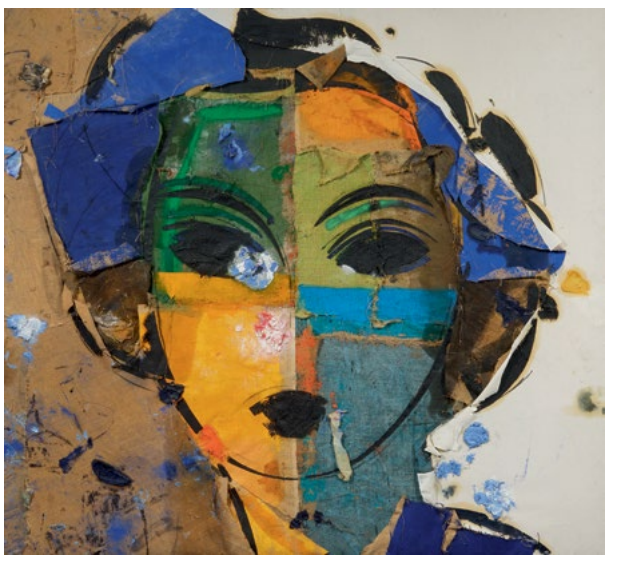
3443 MANOLO VALDÉS Dorothy IX. 2003. Oil, paper, tar and jute collaged with yarn and staples, on jute. 180 × 300 cm. CHF 180 000 / 300 000 Sold for CHF 350 000