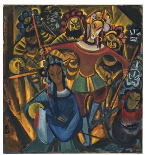
251 LIN FENGMIAN Sun Wukong and his opera retinue in the play 'Uproar in Heaven'. Ink and colours on paper. 69 × 65 cm. CHF 180 000 / 250 000 Sold for CHF 375 000