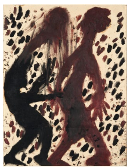
3081 LOUIS SOUTTER Lutte avec le Démon. 1938–1939. Mixed media on paper (finger painting). 57.5 × 44 cm. CHF 200 000 / 300 000 Sold for CHF 287 000