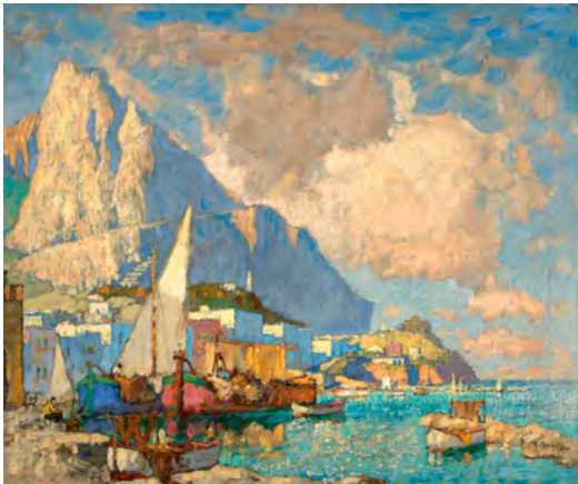
3119 KONSTANTIN IVANOVICH GORBATOFF A view of Capri. Oil on canvas. 50.3 × 60.4 cm. Sold for CHF 134 000