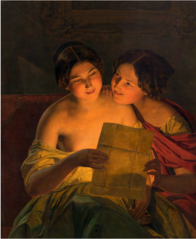
3141 FERDINAND GEORG WALDMÜLLER The love letter. 1848. Oil on canvas. 78 × 64.5 cm. Sold for CHF 232 000