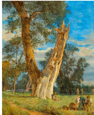
3152 FERDINAND GEORG WALDMÜLLER A group of people on the Prater. 1833. Oil on panel. 31 × 25.5 cm. Sold for CHF 73 000