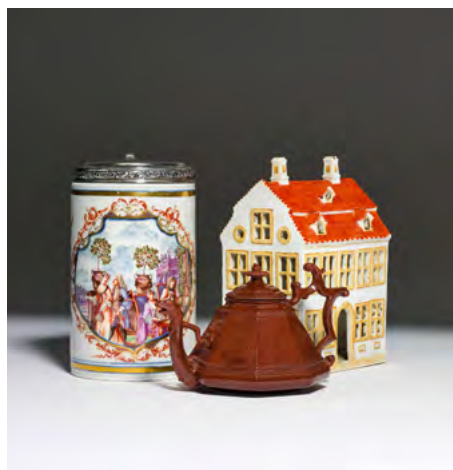
MEISSEN PORCELAIN FROM THE DUCRET COLLECTION 1) A Höroldt tankard (lot 1059), Sold for CHF 90 600 2) A model of a town hall (lot 1050), Sold for CHF 29 600 3) A Böttger stoneware teapot (lot 1039), Sold for CHF 98 000