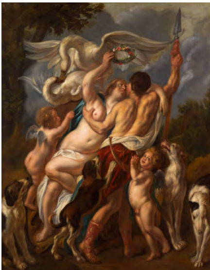
3046 JACOB JORDAENS Venus and Adonis. Oil on canvas. 197.5 × 155 cm. Sold for CHF 183 000