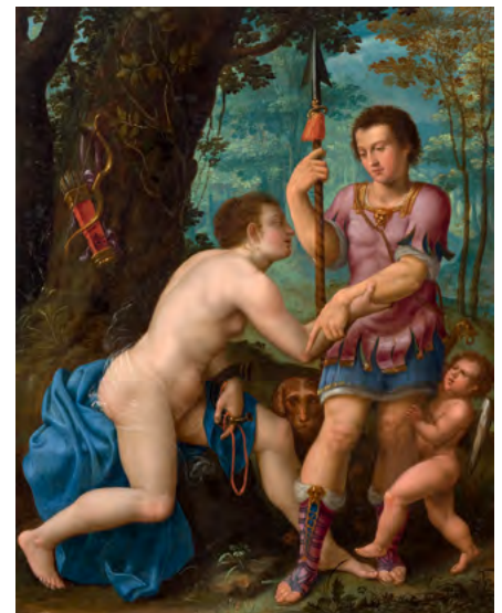
3023 ATTRIBUTED TO DANIEL FRÖSCHL Venus and Adonis. Circa 1600. Oil on copper. 32.3 × 24.3 cm. Sold for CHF 92 000