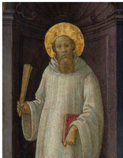
3002 FILIPPINO LIPPI Saint Benedict. Circa 1470–75. (detail) Oil on tempera on panel. 63.3 × 23.3 cm. Sold for CHF 134 000