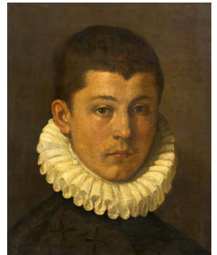
3036 CIRCLE OF ANNIBALE CARRACCI Portrait of a young man with a ruff collar. Oil on canvas. 40.2 × 33.2 cm. Sold for CHF 226 000