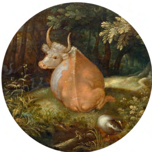
3022 ROELANT SAVERY Cow reclining in a landscape. 1604. Oil on panel. D 17.5 cm. Sold for CHF 128 000