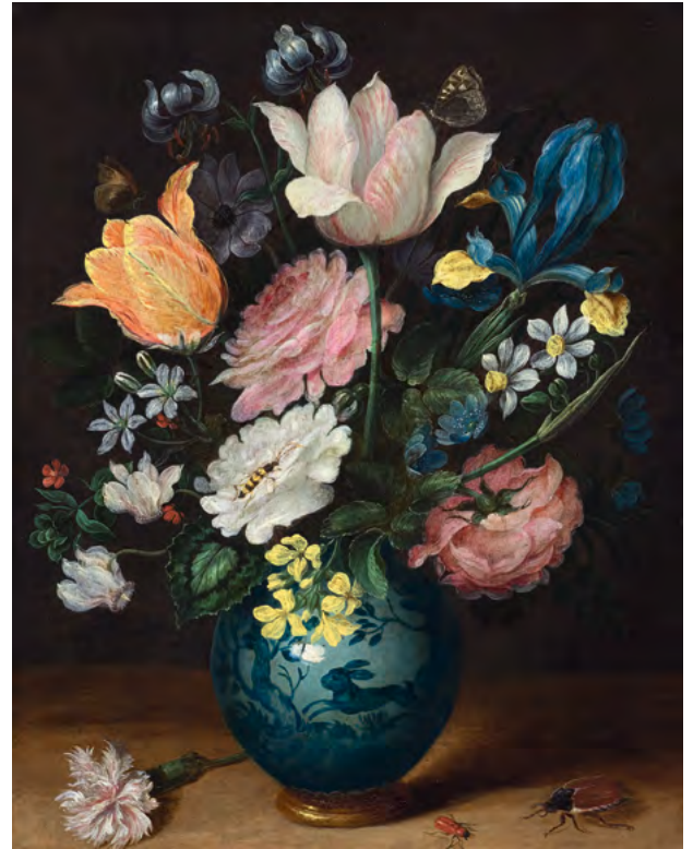
3026 JAN BRUEGHEL THE YOUNGER A bouquet of flowers in a porcelain vase. Oil on copper. 28.4 × 23.2 cm. Sold for CHF 122 000

Among the 19th-century works, Ferdinand Georg Waldmüller's 'The love letter', a moody depiction of two young ladies by candlelight, sold for CHF 232 000 to a private Swiss collector (lot 3141). A landscape with figures by Waldmüller fetched CHF 73 000 (lot 3152). A vibrantly coloured view of Capri by Russian expatriate artist Konstantin Gorbatoff changed hands for more than double its estimate at CHF 134 000 (lot 3119), and a tranquil river view by Eugène Boudin (lot 3135) also doubled its estimate at CHF 104 000.