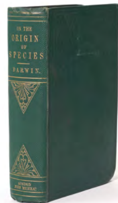
291 CHARLES DARWIN On the Origin of Species by Means of Natural Selection, or the Preservation of Favoured Races in the Struggle for Life. London, John Murray, 1859. First edition. Sold for CHF 98 000