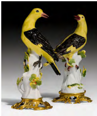
1065 TWO FIGURINES OF ORIOLES WITH GILT BRONZE MOUNTS Meissen, the models by Johann Joachim Kändler, 1733/34, modelled later in circa 1740/47 by Johann Gottfried Ehder / Peter Reinicke. H 25.5 cm. (28.5 cm.). Sold for CHF 103 000