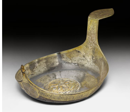
1179 A SILVER-GILT KOVSH PRESENTED BY IVAN V AND PETER THE GREAT Moscow, 1681/82. Inscribed by Czars Ivan V and Peter the Great. Sold for CHF 152 900