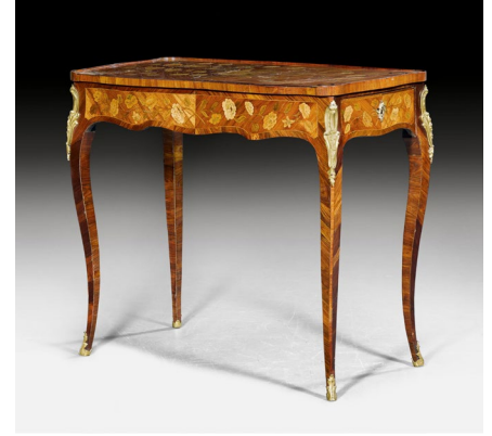
1397 A LOUIS XV LADY'S WRITING DESK "A FLEURS" Attributed to Pierre Roussel ( maître 1745) Paris circa 1760. Sold for CHF 101 300