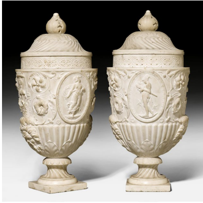
1416 A PAIR OF ITALIAN NEOCLASSICAL LIDDED VASES "A L'ANTIQUE" after drawings by G. B. Piranesi Italy, circa 1780/1800. Sold for CHF 132 500